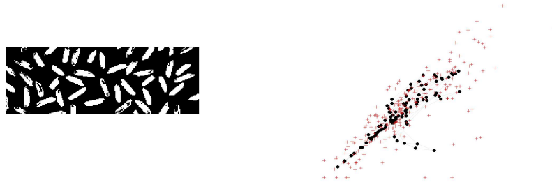
Fig. 2: Left: image of rice grains. Right : Kohonen map of columns of pixel.

Using a black and white image of rice grains, one can illustrates a process on binary variables. The image I in Fig. 2 is a (100 \times 256) -matrix containing only 0/1 ((pixels).