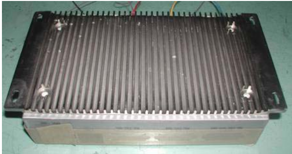
Figure1. Vapor chamber with optimal fin design