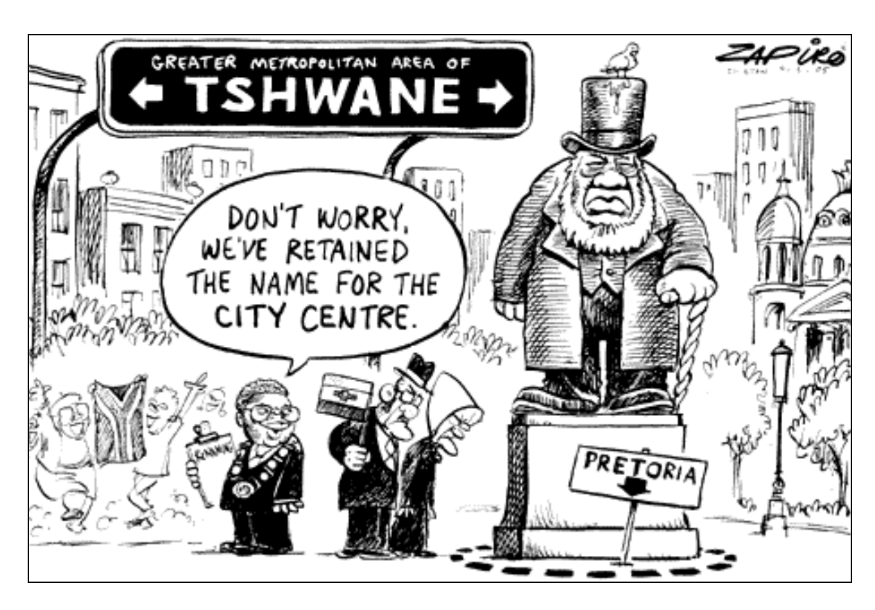
Figure 3. Identity and Territoriality - Pretoria and Metropolitan Tshwane (Source: Cartoonist 'Zapiro', Mail & Guardian , March 2005)