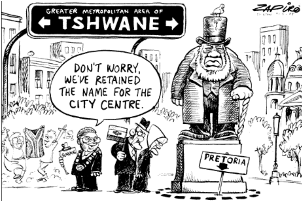
Figure 3. Identity and Territoriality - Pretoria and Metropolitan Tshwane (Source: Cartoonist 'Zapiro', Mail & Guardian , March 2005)