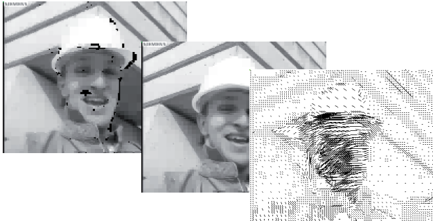
Figure 2: (a) Motion-compensated Y-block image (b) Decoded Y-block image (c) Motion field associated to the region-based representation

the post-processing). Figure 2.c is the motion field resulting from a level of the spatio-temporal segmentation (300 regions) and associated to each block of the restricted partition (139) p^{[16,\dots,2]} .