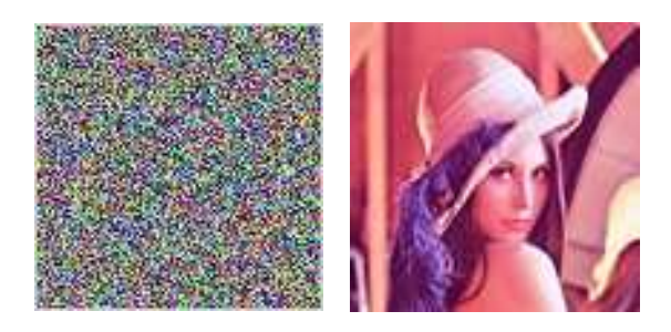
Fig. 4. Left: the encrypted image by Mosquito. Right: the decrypted image by the Mosquito.