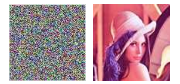
Fig. 3. Left: the encrypted image by the Hybrid Message Embedding. Right: the decrypted image by the Hybrid Message Embedding.

The original image to be encrypted is the well-known Lena picture. Figure 3 depicts respectively the results of the encrypted and the decrypted image through the HME cryptosystem while Figure 4 depicts respectively the results of the encrypted and the decrypted image through Mosquito.