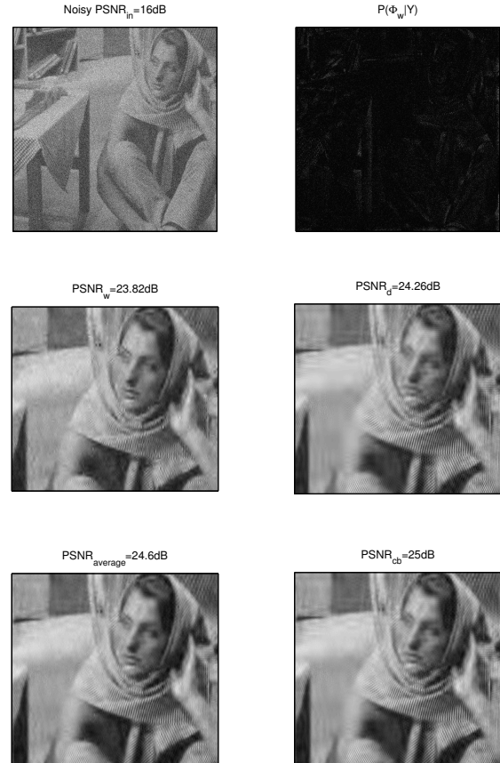
Fig. 3. Illustration on the Barbara image with \text{PSNR}_{in} = 16\text{dB} ( \sigma_\varepsilon = 40 ). From top to bottom and left to right: noisy, "wavelet" probability map, estimate in wavelets, estimate in local DCT, combined by averaging, optimally combined estimate.