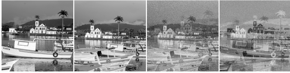
Fig. 1. Left pictures : the 256 \times 256 source images. Right pictures : two different mixtures. Gaussian noise is added such that the SNR is equal to 10dB.