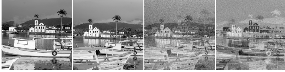
Fig. 1. Left pictures : the 256 \times 256 source images. Right pictures : two different mixtures. Gaussian noise is added such that the SNR is equal to 10dB.