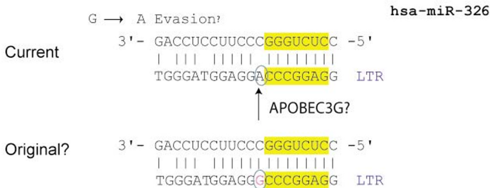
Figure 3 A potential foot print of an HIV-1 escape mutation from human miRNA-mediated selection. The HIV-1 sequence (bottom strand) shown in this figure is from the LTR of pNL4-3. Good base pairing of this sequence with human miR-326 (top strand) is shown (current); however, an even better base pairing (original?) is inferred if a putative APOBEC -mediated "G" to "A" change is corrected.

Since its first description a relatively short period of time ago, 9868 papers have already been published on RNAi (data from Pubmed search using the term, RNAi). An additional prediction (which will almost certainly be correct) is that RNA-guided gene regulation will continue to hold many exciting and unexpected scientific findings which will be published profusely in the coming years.