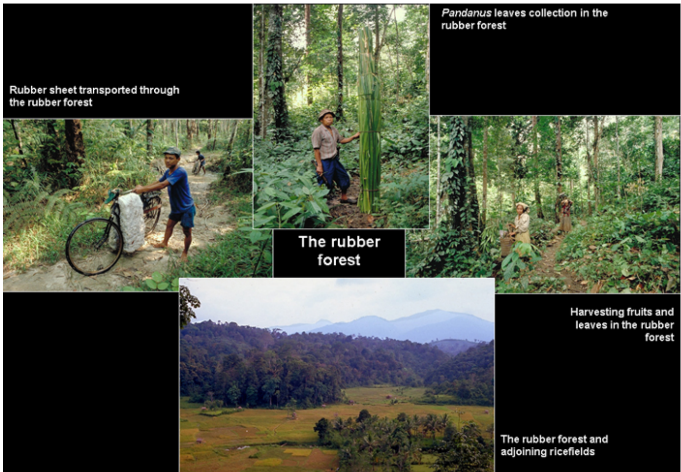
Fig. 5. Various facieses and products from the rubber forest.

foundation of the domestic group. The large areas covered with agroforestry parklands in sub-Saharan Africa, which sustain the livelihood of millions, constitute a similar example of the silvicultural success of local farmers in the drier regions of the Tropics (Sheperd et al. 1993, Boffa 1999, Bodin et al. 2006).