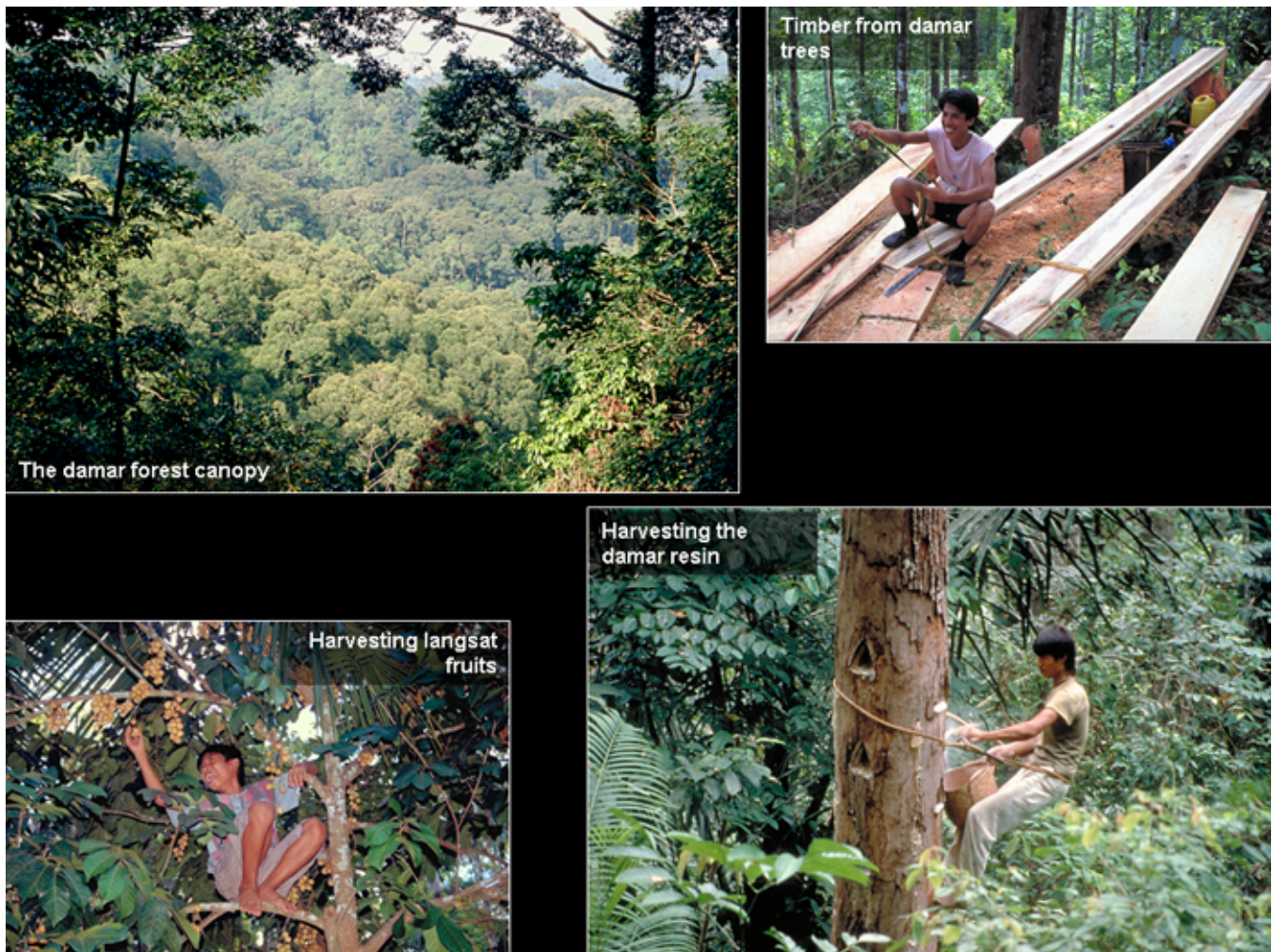
Fig. 7. Various facieses and products from the damar forest.

reversibility, but also of multifunctionality, which are nowadays considered as the three fundamental qualities of any sustainable resource management.