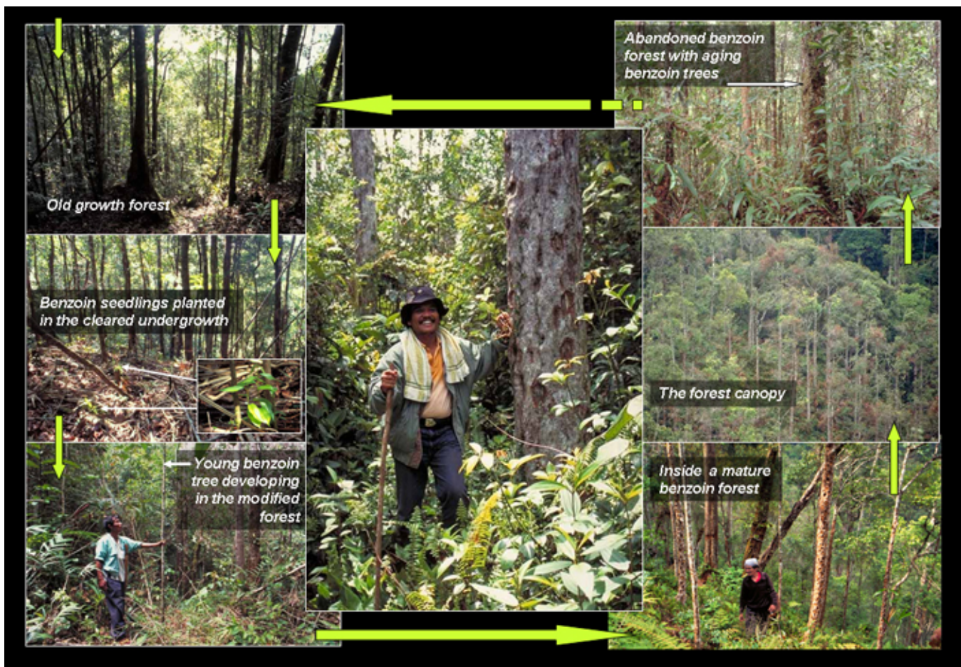
Fig. 1. The benzoin forest establishment and cycle in North Sumatra, Indonesia.

in India (Depommier 2003), the coconut-based agroforests in the Pacific islands (Lamanda et al. 2006), the Chagga home gardens on Mount Kilimanjaro (Fernandez et al. 1984, Verdeaux 2003), the village groves of forest-savanna mosaic in Guinea (Fairhead and Leach 1996), oil palm groves in central and West Africa (Dupire and Boutiller 1958, Raison 1988), or cocoa growing under forest canopy in Ivory Coast (Rougerie 1957, Gastellu 1980, Léonard and Oswald 1996) and Cameroon (Dounias 2000) where even the most intensive cocoa plantations are increasingly shifting away from monoculture toward a more mixed system. Agroforestry parklands, though exhibiting different structures in relation to a dryer climate, are equivalent in their principles to these agroforests of the humid tropics. They encompass the Khejri