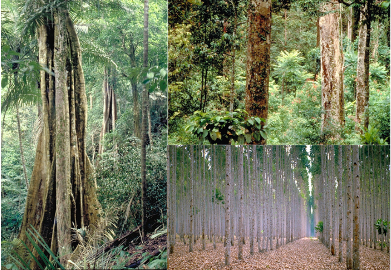
Fig. 9. Natural forest (left, Borneo), domestic forest (upper right, fruit forest, Sumatra), and monocrop forest plantation (lower right, Eucalyptus, Congo) confronted: if biodiversity levels in domestic forests are not as high as in natural forests, they are much higher than in monocrop forest plantations.

why it is so (Descola 1987, Brunois 2004). The Achuar people of the Amazon, for instance, exemplify how human societies may include in their cultural universe elements that modern thinking usually considers as natural and totally apart from humans. Forest socialization by the Achuar is thought as a relationship system organized at the domestic unit level and totally isomorphic with the one used for humans within that unit: forest animals and plants are considered as father, son, or brother in law and symbolically treated as such by their human partner (Descola 1987). More broadly, this symbolic domestication sets the principles that define how the group and its elementary units will interact with forest elements. Forest domestication