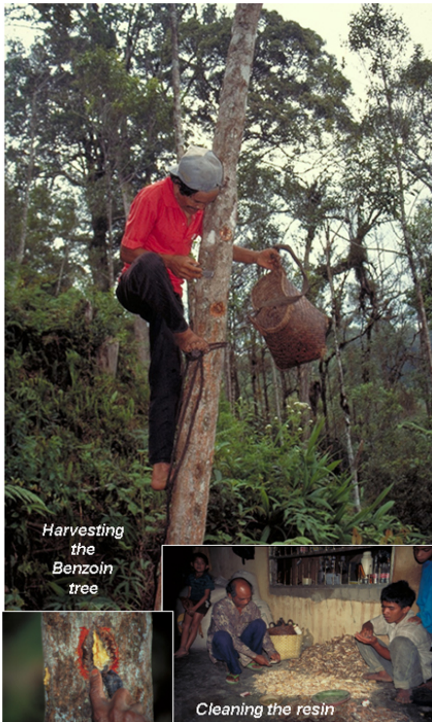
Fig. 2. Harvesting and sorting benzoin resin.