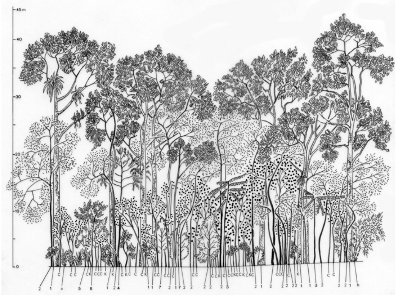
Fig. 8. A sketch-profile drawn from a fruit forest in West Sumatra, Indonesia showing the complex, forest-like structure of the vegetation.

ideologies and representations, with economic strategies and socio-political relationships within and between human groups. The forests we see constitute the visible part of a larger space, which is altogether material, economic, mental, social, and political.