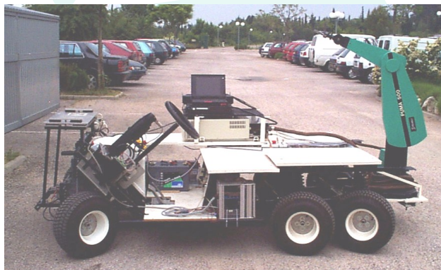
Figure 1: LIRMM's mobile manipulator

In this paper we focus on the motion generation and control of a particular mobile manipulator composed of a wheeled vehicle and a six-revolute-axis manipulator, thus presenting some non-holonomic constraints (see Figure 1). A point-to-point motion of the manipulator's end-effector is generated off-line and the resulting data are downloaded to the real system for experimental testing. This paper summarizes the approach used for motion generation and focuses on the experimental results for various trajectories. These results show that the steady-state positioning error of the manipulator's end-effector can be important, although very small in simulation. We try to analyze the causes of these errors and propose solutions to improve the experimental results.