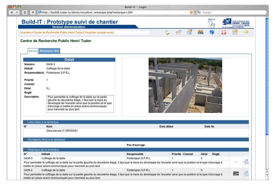
Fig. 1. Built-IT prototype screenshot

The first Build-IT service<sup>5</sup>, developed in the Build-IT project, is intended to manage exchanges around the meeting report. Then it supports direct supervision in hierarchical organizations. It is a typical situation of construction activity, where the coordinator writes a meeting report describing particular points to be adjusted.