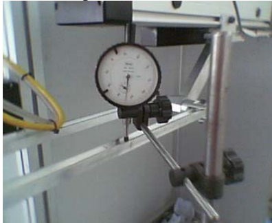
Fig. 3. Experimental Setup

The first calibration experiment produced rather high parallelism deviation, up to 2.37 mm, which in the frames of the adopted kinematic model was expected to be reduced down to 1.07 mm only (Table 1). The corresponding residual norm was also rather high and yielded unrealistic estimate of the measurement noise parameter \sigma \approx 1.0 mm. It impels to conclude that the mechanism mechanics requires more careful tuning. Consequently, the location of the joint axes was adjusted mechanically to ensure the leg parallelism for the Zero posture.