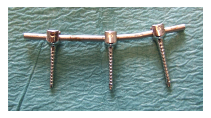
Fig. 3. Picture of on part of the current implant placed on the lumbar vertebra of the patient

Currently, implant represented in figure 3 is set up through a 25cm large incision. That is why the main stem can be "easily" inserted in the three screw heads.