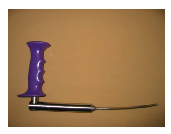
Fig. 4. Picture of the first surgical tool prototype

The difficulty resides in the fact that there is no visibility inside the human body during all this new established operative procedure. The precise placement of the holes (located compared to the vertebrae) depends of the knowledge and the experience of the surgeon. The delicate insertion of the screws through the skin, muscles and grease, without damages caused to the patient, requires the design of complementary surgical tools.