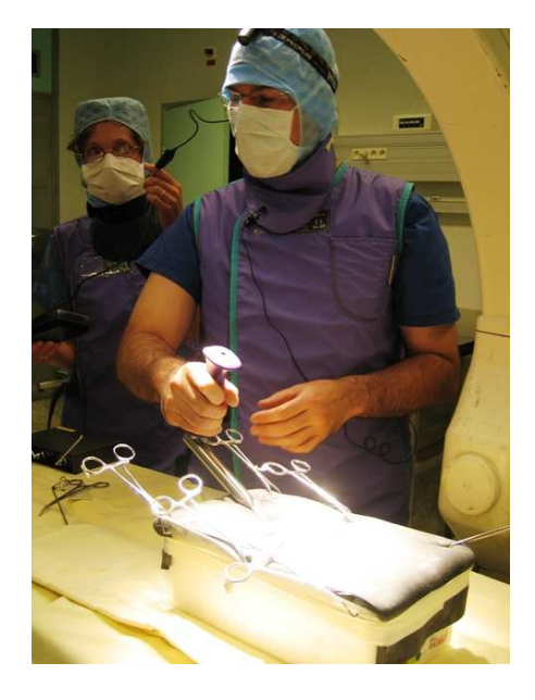
Fig. 6. Surgeon manipulates the prototype during the scenario

Thanks to the information collection equipment installed in the operating room, a large part of the work consists in organising and analyzing the recovered data. Several improvements were considered, mainly starting from the films and the speech recorded during the scenario.