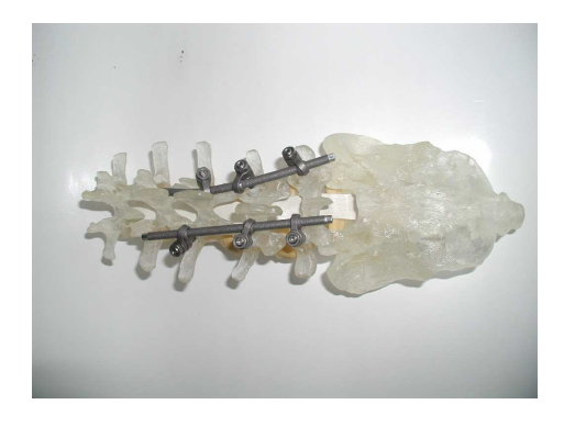
Fig. 2. Picture of the implant placed on the lumbar vertebra of the patient

Following this observation, the surgeon has explained his need concerning the use of minimally invasive surgical tools.