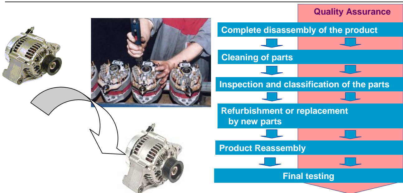
Figure 1 The remanufacturing process

Currently, in most of the cases, remanufacturing processes must be adapted to existing products because products have not been initially designed to be remanufacturable [17]. However, the process adaptations increase costs and this can lead the overall benefits of the remanufacturing process to be reconsidered. Therefore, new technical criteria have to be defined to design true remanufacturable products, to increase their performances and their life time. This also means that new specific materials should be developed with new performances (e.g. ability to be cleaned, life time increase).