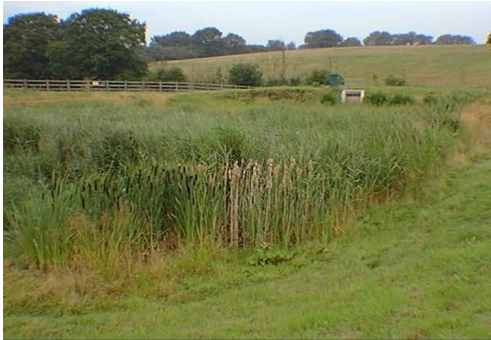
(a) Constructed wetland