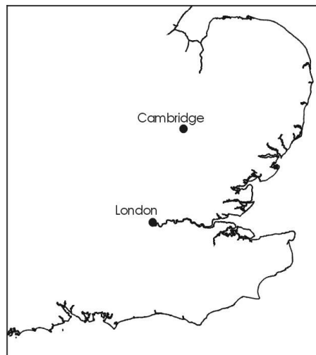
Figure 1: South east England showing the location of Cambridge.

This paper reports the outcome of a consultation with a range of stakeholders in the Clay Farm development on their preference for and opinions of examples of BMPs, in comparison to conventional drainage systems.