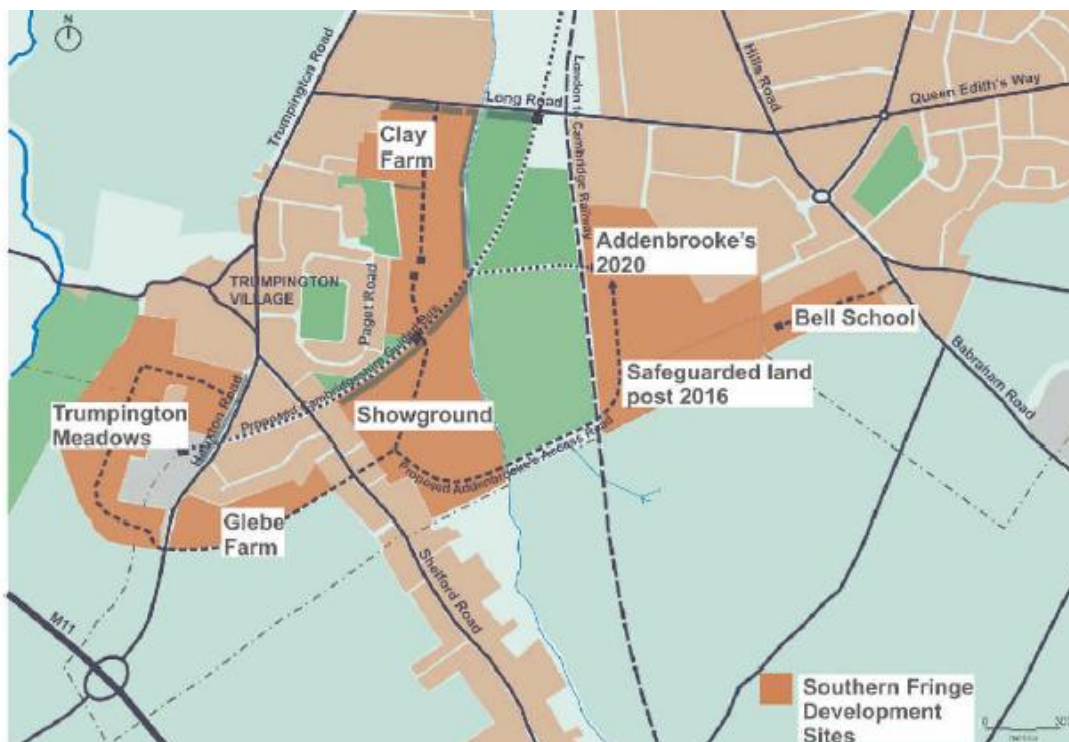
Figure 2: Cambridge Southern Fringe development sites (Cambridge City Council, 2005b. www.cambridge.gov.uk ).