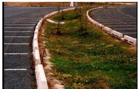
(b) Infiltration trench