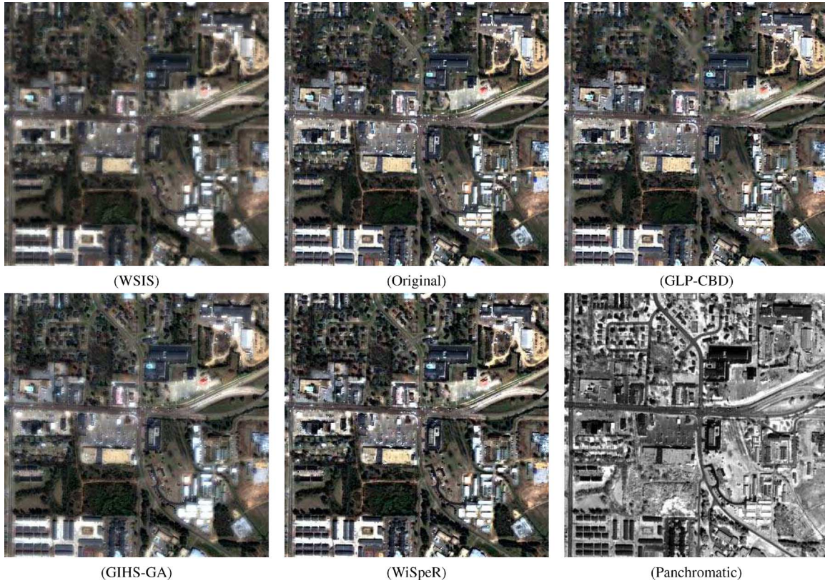
Fig. 2. Results of the fusion algorithms displayed as 352 \times 352 true color compositions at 2.8-m pixel spacing for the degraded QuickBird image of Mississippi State University campus, outskirts ROI. The reference 2.8-m original MS bands and the degraded 2.8-m Pan image are also displayed.