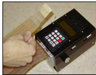
Fig. 1A. Wire TDU: 12 \times 12 matrix and flexible cable [2]

Within this context, with the help of the companies Coronis-Systems and Guglielmi Technologies Dentaires, we have developed a wireless radio-controlled version of the 6 \times 6 TDU matrix. This consists in a matrix glued onto the inferior part of the orthodontic retainer including microelectronics, antenna and battery, which can be worn inside the mouth like a dental retainer (Figure 1B). Note that it was decided to reduce by a factor of 4 the overall size of the Bach-y-Rita's device since the addressed biomedical applications do not require the dense 12 \times 12 TDU resolution of the tactile visual substitution systems.