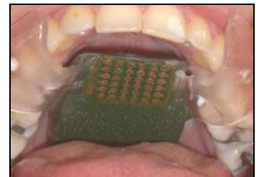
Fig. 1B. Wireless TDU: 6 \times 6 matrix and embedded radio-frequency circuit

Manuscript received April 2, 2007. This work was supported in part by the company IDS, Floralis (Université Joseph Fourier, Grenoble), and the Fondation Garches. The company Vista Medical is acknowledged for supplying the FSA pressure mapping systems.