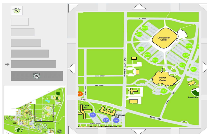
Fig. 1. Gaze-controlled user interface of the map-based application. Control buttons are in grey.