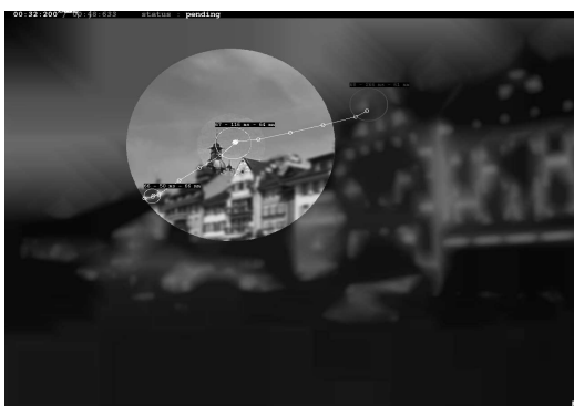
Fig. 2. Play back: gaze-controlled lens. Three fixations are visible; the one on the right is starting.

We are currently investigating two research directions in parallel so as to overcome the main usability weakness of contingent displays, that is, their insufficient reactivity by: (i) increasing the sampling frequency rate, from 60 Hz to 240 Hz, with a view to shortening fixation detection time; (ii) achieving a satisfactory trade-off between accuracy and time delay by analysing saccade velocity variations to predict next fixation approximate landing. An approach combining both strategies will also be tested. Finally, to further improve the usability of gaze-contingent displays, we shall test whether smooth degradation of resolution is actually more comfortable visually than stepwise reduction.