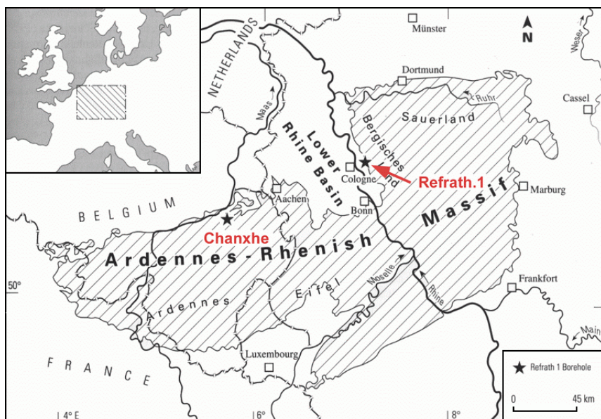
Figure 1: The Ardennes-Rhenish Massif and the location of the reference section and borehole, respectively in a neritic (Chanxhe) and a pelagic (Refrath 1) facies.

FRÖDER & STREEL, 1994; HARTKOPF-FRÖDER, 2004). The sedimentary rocks of the Refrath 1 borehole are mainly dark grey, partly calcareous mudstones; rare marlstone intercalations are considered to be fine-grained turbidites. Both contain many fossils. Aside from the very well preserved miospores of the Retispora lepidophyta - Knoxisporites literatus (LL) miospore Zone, numerous other microfossils are known i.e. conodonts (PIECHA, 2004) and entomozocean ostracodes (GROOS-UFFENORDE, 2004). Some characteristic ammonoid species are present in the lowermost part of the borehole (KORN, 2004).