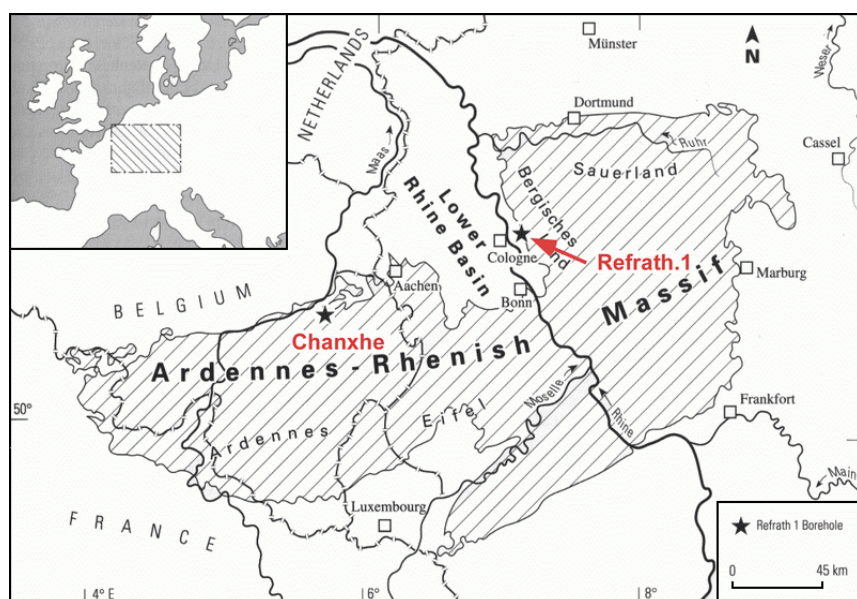
Figure 1: The Ardennes-Rhenish Massif and the location of the reference section and borehole, respectively in a neritic (Chanxhe) and a pelagic (Refrath 1) facies.

FRÖDER & STREEL, 1994; HARTKOPF-FRÖDER, 2004). The sedimentary rocks of the Refrath 1 borehole are mainly dark grey, partly calcareous mudstones; rare marlstone intercalations are considered to be fine-grained turbidites. Both contain many fossils. Aside from the very well preserved miospores of the Retispora lepidophyta - Knoxisporites literatus (LL) miospore Zone, numerous other microfossils are known i.e. conodonts (PIECHA, 2004) and entomozocean ostracodes (GROOS-UFFENORDE, 2004). Some characteristic ammonoid species are present in the lowermost part of the borehole (KORN, 2004).