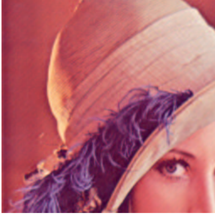
Part of I_W ( \mu = \mu_{Lum} )