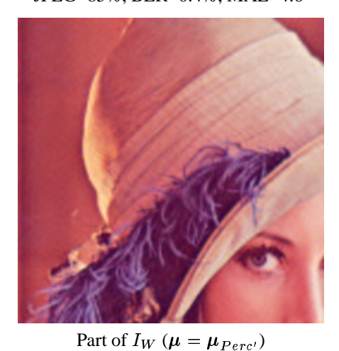
JPEG=85%, BER=0.4%, MAE=13.6