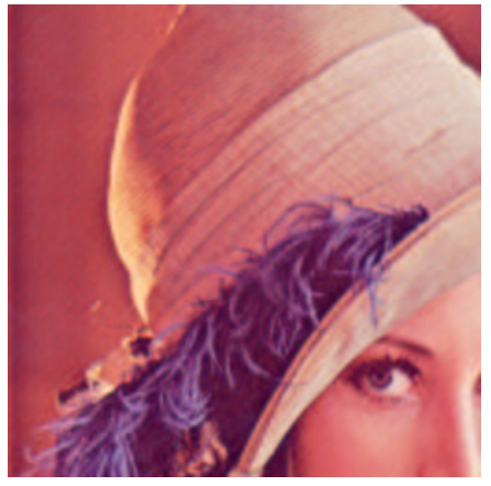
Part of I_W ( \mu=\mu_{Lum} ) JPEG=85%, BER=0.4%, MAE=4.6