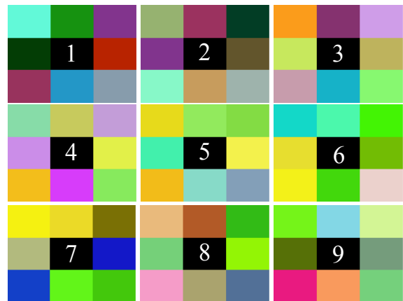
Figure 2 : Screenshots of our Interactive One-max optimization problem (numbers represents the generation)