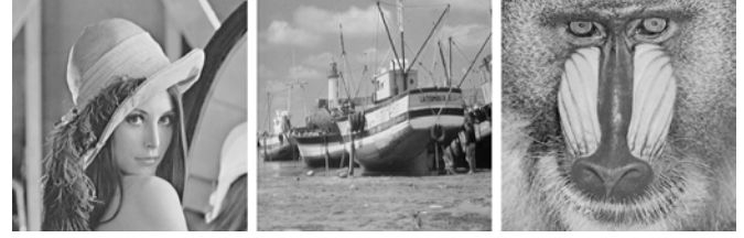
Fig. 2. Test images.

The LUT for detection is similarly organized. The meaning of F and S is slightly different. F = 1 indicates that a bit of data is embedded into the LSB of the second pixel ( F = 0 if not). S = 1 indicates that the true LSB of the first pixel should be restored from the saved bit sequence, and S = 0 means that both pixels are already recovered. The entries corresponding to transformed pairs contain the recovered values computed by the inverse transform, F = 1 and S = 0 . For the marked pairs of