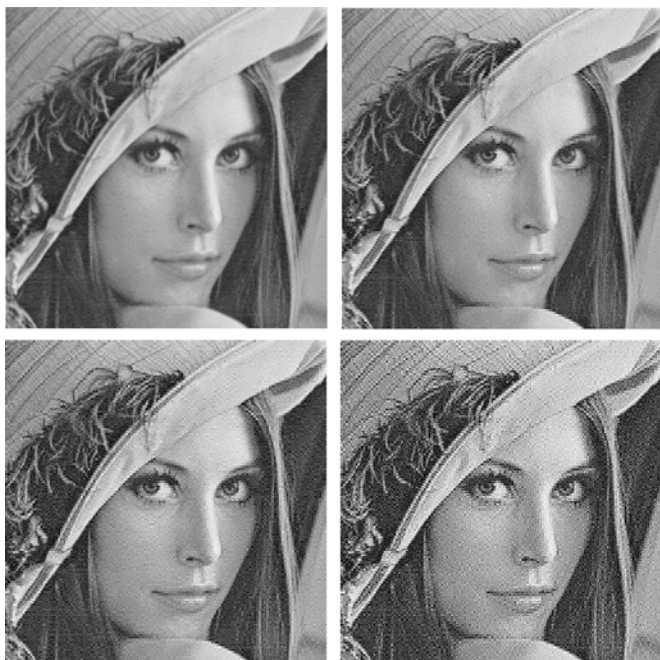
Fig. 3. Details of the marked copies in clockwise order: 0.40 bpp, 37.17 dB; 0.90 bpp, 28.48 dB; 1.30 bpp, 23.54 dB; 1.80 bpp, 16.23 dB.