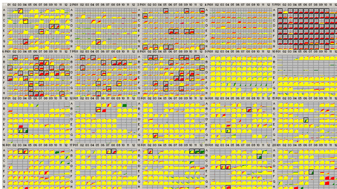
Figure 3 PM comparative analysis of RN6390 WT and hfq strains. The WT and the hfq mutant were subject to PM analysis of ~ 2000 phenotypes. Incubation and time course curves for respiration (tetrazolium color formation) in specific conditions were generated with Omnilog-PM software (see for more details [42]). The PM kinetics shows consensus data comparing the RN6390 hfq mutant (green) to its respective WT strain (red). Red indicates a stronger response by the parental strain and green indicates a stronger response by the hfq mutant. When the two strains have equivalent metabolism or sensitivity to a stress or chemical agent, the red and green kinetic graphs overlap and are yellow. Boxes surrounding a specific condition indicate a significant difference in response. Values of gain or loss of phenotypes are in Table I of supplementary data.

significant differences were observed between WT and hfq mutant strains (data not shown).