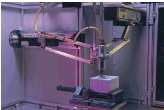
Fig. 1. The Orthoglide mechanism

The remainder of the paper is organised as follows. Section 2 describes the manipulator geometry, its inverse and direct kinematics, and also contains the sensitivity analysis of the leg parallelism at the examined postures with respect to the joint offsets. Section 3 focuses on the measurements and parameter identification. Section 4 contains experimental results and their discussion, while Section 5 summarises the main results.