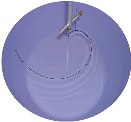
FIG. 3: (Color online) Photography of the wave crests generated on a water surface by a needle rotating counterclockwise along a circular trajectory (radius \mathcal{R} \approx 2.7 \text{ cm} \approx 9 \kappa^{-1} ) with a velocity V \approx 21 \text{ cm} \cdot \text{s}^{-1} \approx 0.9 c_{\min} . The black curve represents the predicted Archimedean spiral with radius a given by Eq. (8).

To summarize, we have shown theoretically that a disturbance moving along a circular trajectory experienced