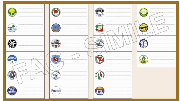
Figure 1. Facsimile of a paper ballot for European elections used in Italy

To give an idea of what a paper ballot looked like in the Italian elections, I present in figure 1 an actual ballot still used for the European elections today. The voter chooses a party by drawing a cross on the party's symbol, and may optionally express a number of ranked preferences by writing down candidate names on the lines on the right of the party's symbol. In the current European election method the number of these preferences is limited to three; in the Italian parliamentary elections in the 80's the voter could express up to 4 preferences and lists with over 40 candidates were commonplace.