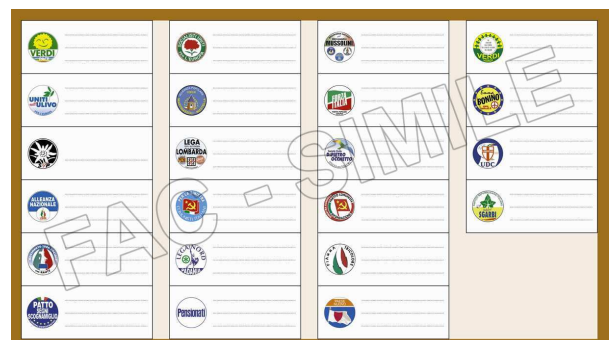
Figure 1. Facsimile of a paper ballot for european elections used in Italy

To give an idea of what a paper ballot looked like in the Italian elections, I present in figure 1 an actual ballot still used for the European elections today. The voter chooses a party by drawing a cross on the party’s symbol, and may optionally express a number of ranked preferences by writing down candidate names on the lines on the right of the party’s symbol. In the current European election method the number of these preferences is limited to three; in the Italian parliamentary elections in the 80’s the voter could express up to 4 preferences and lists with over 40 candidates were commonplace.