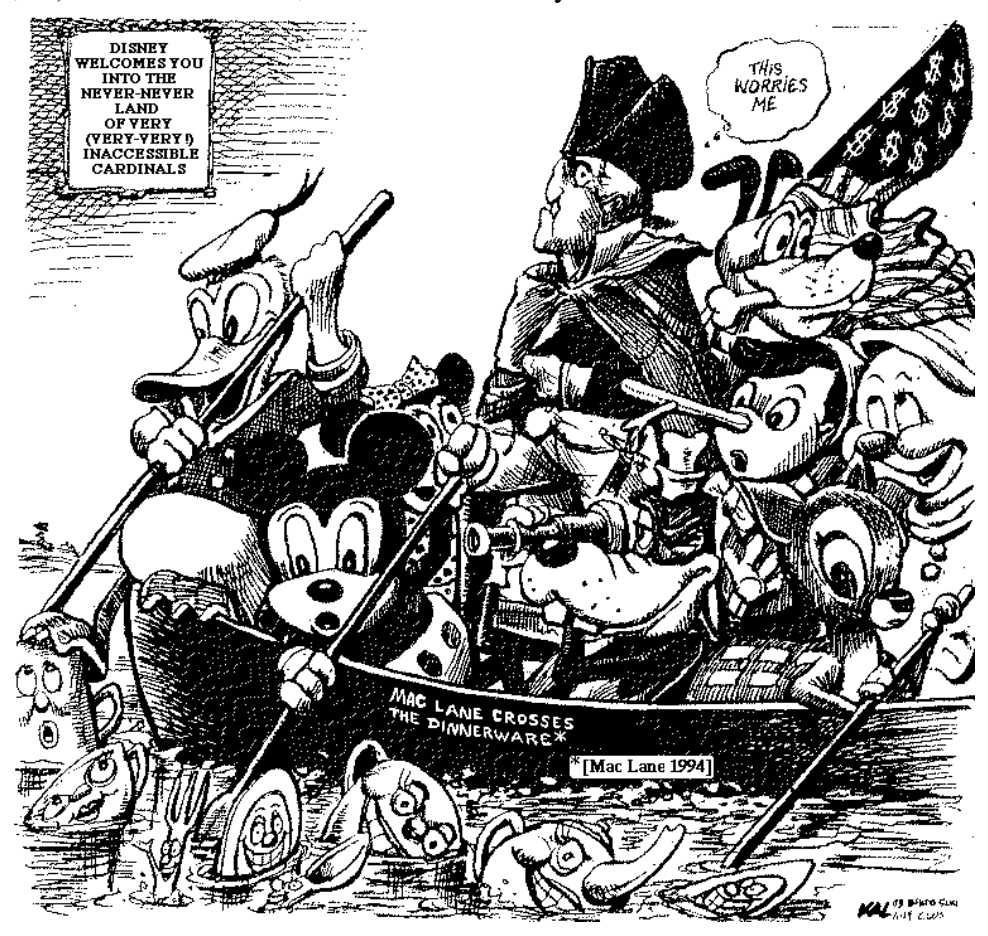
«I admire Gödel's accomplishments, but I suspect that it is futile to wonder now what he imagined to be the «real» cardinal of the continuum. Those earnest specialists who still search for that cardinal

Worse still, «the generalized continuum hypothesis can fail everywhere» [Foreman, Woodin 1991] (the issues of the continuum and the Generalised Continuum Hypothesis, GCH , will be raised anew, and in a more serious vein, in §§7, 11) ... Tell me another, fumes bombastically Mac Lane: