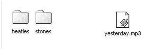
Figure 1. Use of a sub-context