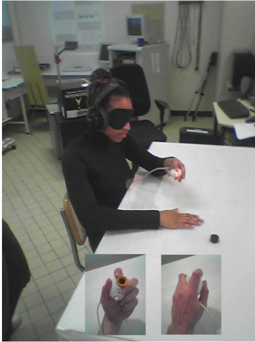
Figure 1. Experimental setup and the imposed hand grasping posture for holding the webcam.

1 Laboratoire de Neurophysique et Physiologie. CNRS UMR 8119 et Université René Descartes. UFR Biomédicale des Saints Pères, 45 rue des Saints-Pères. 75270 Paris, France sylvain.hanneton@univ-paris5.fr