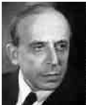
R. Von Mises

Already back in 1919, Von Mises had proposed an improvement toward the definition a random sequence, by means of a new concept of “collective” 3 which sought to describe a typical game of heads and tails. The idea is to ask for more than asymptotic averages and to think of a player gambling only at some random times depending on the evolution of the game : a sequence of digits is a “collective” if it satisfies the law of large numbers and if any subsequence obtained by a non-anticipative selection rule satisfies also the law of large numbers. This interesting approach, which portends the notion of “stopping time”, does nevertheless have the disadvantage of being difficult to apply in practical terms. A. Wald, one of the founders of statistics and decision theory, proposed in 1937 the more precise notion of “collective relatively to a family of rules”.