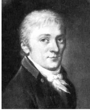
F. Gauss in 1803