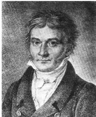
F. Gauss in 1828

Secondly, Gauss himself ( Theoria motus coelestium , 1809) elaborated the famous argument proving (with some implicit hypotheses) that once it has been assumed the arithmetic average is the best value to retain from among several results of quantity measurements, then, the probability law of the error is necessarily the normal law. This argument has been made more rigorous by Poincaré at the end of the century. Thirdly, Laplace ( Théorie analytique des probabilités , 1811) demonstrated how the least squares method is useful for solving linear systems when the number of equations does not agree with the number of unknowns.