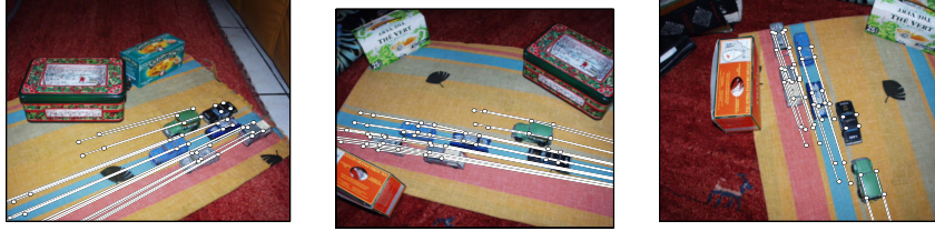
Figure 6: Dynamic points transferred between images using plane homographies associated with the motion plane, i.e. as if they were static. These plane homographies have been estimated by hallucinating point correspondences (see text) and minimizing the symmetric squared distance between measured and transferred features. The final error is 0.35 pixels while the initial guess provided by the closed-form solution (not shown here) has an error of 2.77 pixels.

where \mathcal{C} \times \mathbf{F} is the column-wise cross-product of \mathcal{C} and \mathbf{F} . The proof of this result is omitted and may be found in [2].