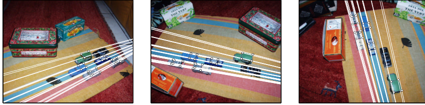
Figure 5: Motion line pencils estimated using two-view projective bundle adjustment between the first and the second views and constrained estimation of a 5-dof C-tensor between the second and third views. Note that the motion lines pencils are perfectly aligned in the second image.

where \mathbf{G} contains the unknown motion line pencil transformation and \mathbf{b} is the known projection of the incidence point in the first image. Let us see how to solve for \mathbf{G} . Let [\mathbf{b}]_{\times} \sim \mathbf{U}\Sigma\mathbf{V}^T be a singular value decomposition of [\mathbf{b}]_{\times} where \Sigma = \text{diag}(1, \sigma, 0) . An efficient solution to obtain this decomposition is given in [8]. By replacing into equation (4), we obtain: \mathbf{x}'^T \bar{\mathbf{G}} \bar{\mathbf{y}} = 0 with (\bar{\mathbf{G}}_{(3 \times 2)} \mathbf{0}_{(3 \times 1)}) = \mathbf{G}\mathbf{U}\Sigma and (\bar{\mathbf{y}}_{(2 \times 1)}^T \mathbf{y}) = \mathbf{V}^T \mathbf{x} . Note that \bar{\mathbf{G}} is defined by 6 homogeneous parameters \bar{\mathbf{g}} \in \mathbb{P}^5 , which is consistent with the fact that \mathbf{G} has 5 dof 1 . Expanding this equation leads to an homogeneous linear system for \bar{\mathbf{g}} . Note that 5 equations (hence 5 point correspondences) are sufficient to solve for \bar{\mathbf{g}} in the least squares sense. From \bar{\mathbf{G}} , one can further obtain \mathcal{C} as: \mathcal{C} \sim (\bar{\mathbf{G}}_{(3 \times 2)} \mathbf{0}_{(3 \times 1)})\mathbf{V}^T .