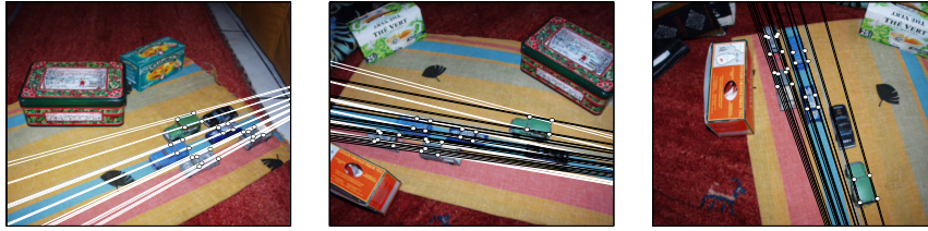
Figure 4: Motion line pencils estimated using two-view projective bundle adjustment. For the middle image, we compute the motion line pencils with respect to two C-tensors (with the first and with the third images). Note the significant discrepancy between them. This discrepancy will be eliminated by a consistent parameterization of the multiple-view case, see §3.2. Note also that points lying on the overtaking car have been discarded as outliers.

Estimation. Another consequence of the analogy between the C-tensor and the fundamental matrix is that one can apply any two-view projective structure and motion algorithm to estimate \mathcal{C} . For instance, we use the 8 point algorithm [9] embedded in a RANSAC-based robust estimation scheme [4] to compute an initial guess of \mathcal{C} , that we further refine using uncalibrated two-view bundle adjustment. In this case, the projective depths of points represent in fact their displacement along the motion lines. Figure 4 shows the result of computing pair-wise C-tensors.