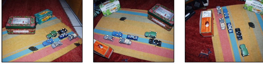
Figure 3: Dynamic points used for the experiments on the toy images. Note that four points are lying on a car which overtakes another one in the second image, and therefore do not fulfill the dynamic motion associated to the other points.

matrices within the framework of [14] or similarly to the join tensors of [16].