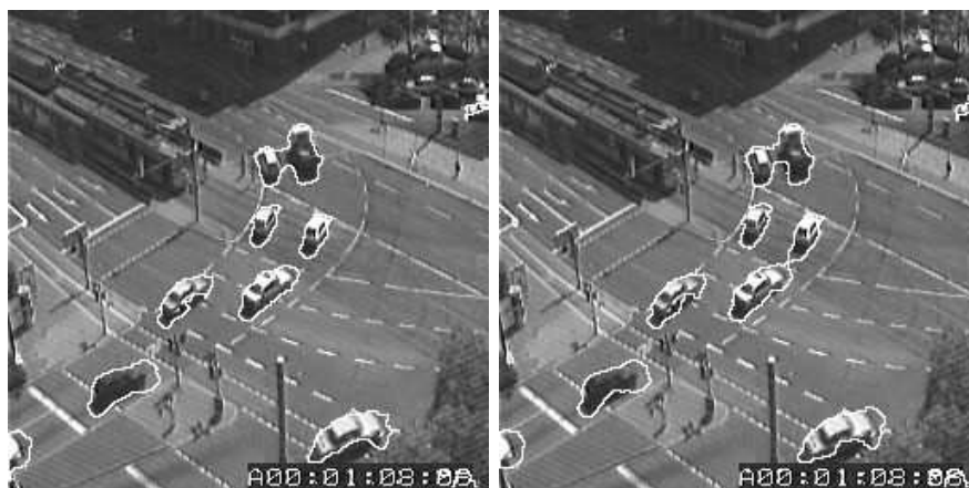
Figure 7: Results obtained (10th image of the sequence) with total variation minimisation (Manhattan with horizontal, vertical and diagonal neighbors) for two different precisions : 0.002 (left image) and 0.01 (right image). Parameters are \lambda = 0.2 and \mu = 10 .