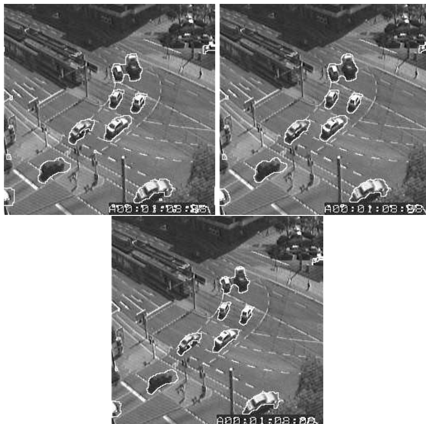
Figure 1: Results obtained with graphcuts with the energy involving TV_{1,g} (first image on top left), TV_{1,g,\frac{\pi}{4}} (top right) and TV_g (bottom). The initial data is the optical flow norm \mathbf{v} . Parameters are \alpha = 0.6 , \lambda = 0.2 and \mu = 10 .