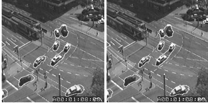
Figure 8: a contrario detection with the optical flow magnitude regularized by TV_{1,g,\frac{\pi}{4}} . The neighborhood radius is N = 3 . The \epsilon parameter is set to one as it is usually done. The left image is the basic result of the a contrario detection eroded with a radius of 1. The right image is one level set of the ROF solution which looks like best the a contrario detection result.