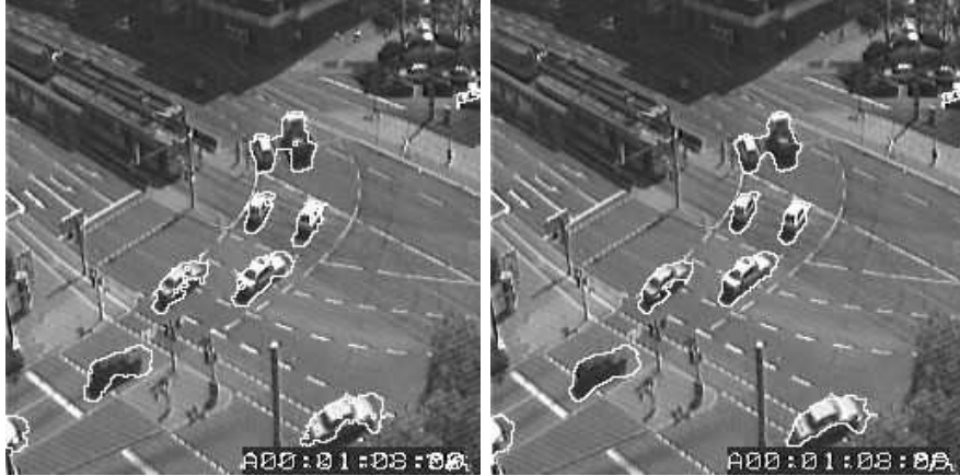
Figure 2: Results obtained (10th image of the sequence) with TV_{1,g} and TV_{1,g,\frac{\pi}{4}} and the optical flow norm as initial data. Parameters are \alpha = 0.6 , \lambda = 0.2 and \mu = 10 . Notice the smoothness of the result on the right image in comparison to the one on the left image.