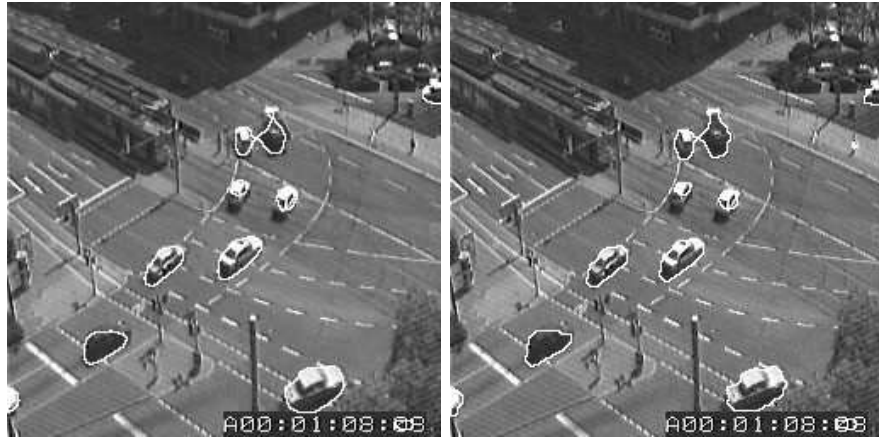
Figure 9: a contrario detection with the difference image between the current image and the background regularized by TV_{1,g,\frac{\pi}{4}} . The neighborhood radius is N = 3 . The \epsilon parameter is set to one as it is usually done. The left image is the basic result of the a contrario detection eroded with a radius of 1. The right image is one level set of the ROF solution which looks like best the a contrario detection result.