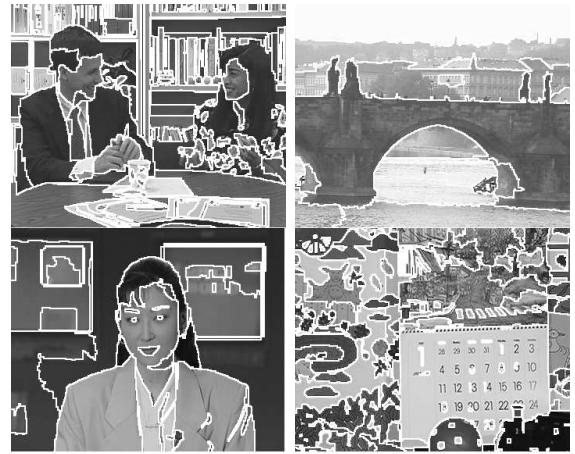
Fig. 2. Results of segmentation of frames from the sequences Paris , Bridge , Akiyo and Mobile .

In this section, we propose to describe optimizations that have been made to allow a real time treatment. The whole algorithm of video segmentation is summarized in figure 3. The algorithm 1 describes more particularly the merging loop which is the critical part for a real time implementation. The term N_e represents the number of edges within the image I in the 4-connectivity. In the merging process, we use the UNION-FIND data structure [13]. The UNION function fuses