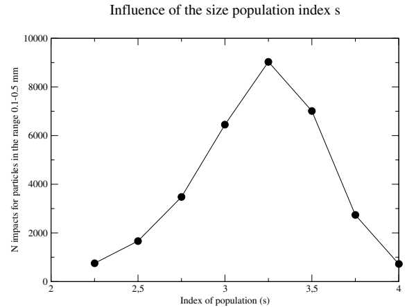
Fig. 3. Influence of the differential size population index s on the expected numbers of impacts for particles in the size range [0.1; 0.5] \text{ mm} .

For this reason we conclude that an encounter with a cm-size meteoroid is not guaranteed, but is likely to happen. It was well known anyway that approaching a cometary nucleus involves certain risks for the spacecraft, and special care was