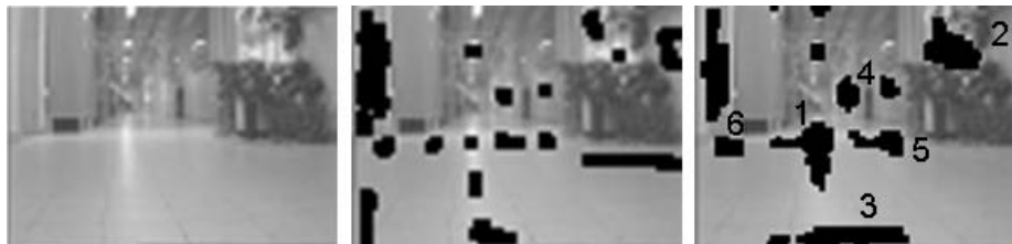
Fig. 3: Input image (left), saliencies extracted by classical processing (center), saliencies extracted by our architecture (right). The numbers on the latter figure specify the temporal order of occurrence.

The results obtained in this study are based on images acquired during a robot ride in our laboratory. The images were reduced from 320x240 pixels to 76x56 pixels and only on the luminance information was considered. Figure 3 shows a prototypical example of our results, the algorithm used for comparison is a combination of gabor and DOG multi-scale processing inspired from Itti's model [7]. The salient locations appear in black on the center image (classical image processing) and on the right image (the presented architecture). Although the salient locations are not exactly the same, the main saliencies are qualitatively identical.