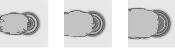
Figure 1: Euclidean norm of \xi at t_1 = 1.5s and t_2 = 1.75s and t_3 = 2s . Case s = 0

In this first experiment, we simulate a wave initially excited by a rotational source located in the center of the domain, in the presence of a horizontal uniform flow with M = 0.5 . The first simulation shows that the method is not stable if the equation is not regularized ( s = 0 ).