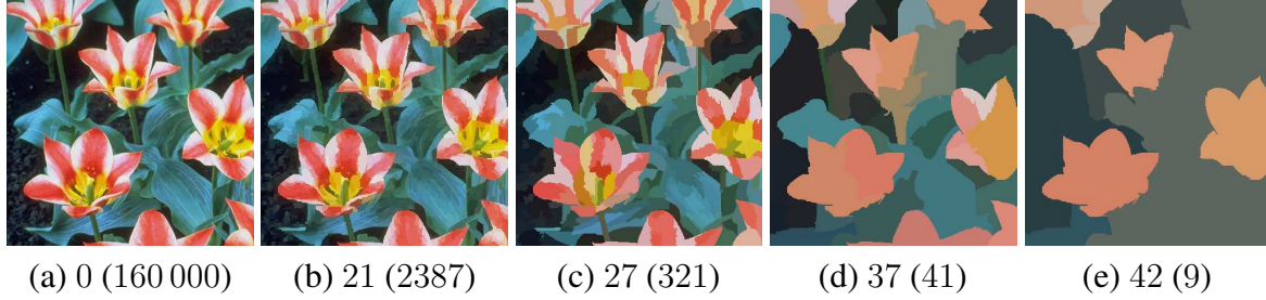
Figure 2: Some levels of the partitioning of “Tulips(cropped)”: level (number of components).

hierarchy of partitions we also need to define \tau(CC) = \alpha/|CC| , where \alpha = const and |CC| is the number of elements in CC , i.e. the size of the region. The algorithm has one running parameter \alpha , which is used to compute the function \tau . A larger constant \alpha sets the preference for larger components. A more complex definition of \tau(CC) , which is large for certain shapes and small otherwise would produce a partitioning which prefers certain shapes, e.g. using ratio of perimeter to area would prefer components that are compact, e.g. not long and thin. For computational efficiency the internal contrast PInt() and the size of the connected component |CC| (receptive field) is stored.