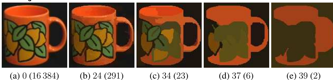
Figure 4: Some levels of the partitioning of “Obj59_0”: level (number of components).

used to produce a kind of the over segmented image and the influence of \tau is smaller after each level of the pyramid. For an overexerted image, where the size of regions is large, the algorithm becomes parameterless.