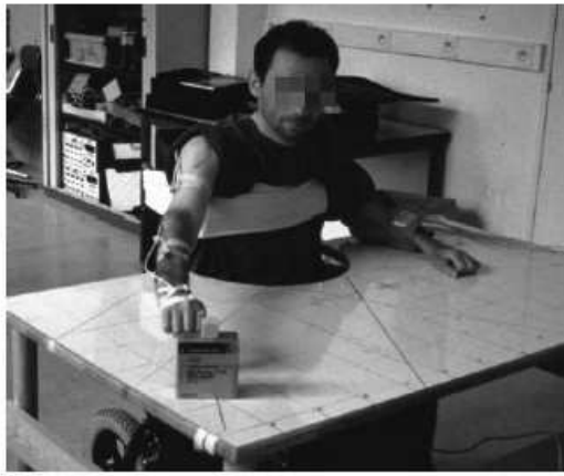
Figure 1. Experimental set-up and task