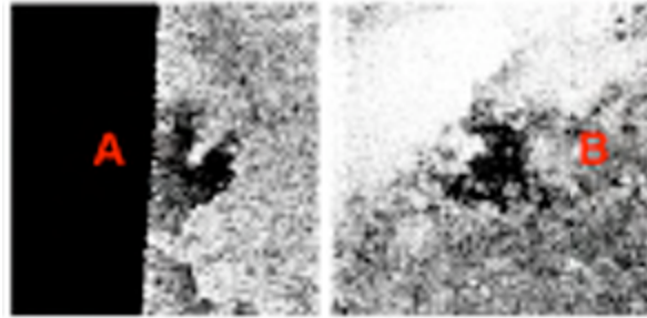
Figure 2. Radar-dark spot A and B in Ta SAR data .

Radar-dark Spots: Figure 2 shows two radar-dark spots observed in the Ta flyby SAR data. These regions are much darker than the rest of the SAR image strip, with backscattered power ranging between -13 \text{ dB} and -10 \text{ dB} . Both are roughly circular of diameter around 17 \text{ km} . Radar-dark spot A is located at 51.23^\circ\text{N} , 76.53^\circ\text{W} and corresponds to a SAR incidence angle close to 30^\circ , while radar-dark spot is located at 49.48^\circ\text{N} , 69.73^\circ\text{W} and corresponds to a SAR incidence angle close to 23^\circ . Passive radiometry data show that dark spots are 3 \text{ K} higher in brightness temperature than their surroundings, which is consistent with a dielectric constant around 2. They were interpreted as possible smooth hydrocarbon deposits [4].