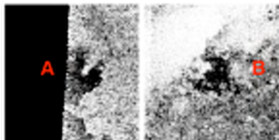
Figure 2. Radar-dark spot A and B in Ta SAR data .

Radar-dark Spots: Figure 2 shows two radar-dark spots observed in the Ta flyby SAR data. These regions are much darker than the rest of the SAR image strip, with backscattered power ranging between -13 \text{ dB} and -10 \text{ dB} . Both are roughly circular of diameter around 17 \text{ km} . Radar-dark spot A is located at 51.23^\circ\text{N} , 76.53^\circ\text{W} and corresponds to a SAR incidence angle close to 30^\circ , while radar-dark spot is located at 49.48^\circ\text{N} , 69.73^\circ\text{W} and corresponds to a SAR incidence angle close to 23^\circ . Passive radiometry data show that dark spots are 3 \text{ K} higher in brightness temperature than their surroundings, which is consistent with a dielectric constant around 2. They were interpreted as possible smooth hydrocarbon deposits [4].