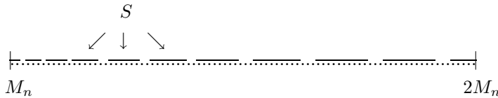
Figure 5: The discretization replaces the Lebesgue measure by the uniform measure on M_n integers, thus the measure of any interval can deviate from its Lebesgue measure by at most \frac{1}{M_n} . For l \leq \alpha M_n^2 the corresponding section of S (in this picture drawn horizontally) consists of at most \alpha M_n intervals, so its measure can deviate by no more than \alpha .