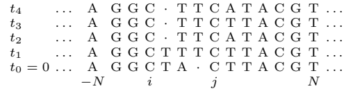
Fig. 3. A random realisation of a computational path: Productions \alpha_1\alpha'\alpha_2 \rightarrow \alpha_1\beta'\alpha_2 occur at random times. At t_1 : \alpha_1 = T , \alpha_2 = C , \alpha' = A and \beta' = TT . At t_2 : \alpha_1 = GC , \alpha_2 = TT , \alpha' = T and \beta' = \kappa . etc. If we allow infinite re-numberings in order to impose a global coordinate system, at some places the configuration must be squeezed. The symbol \cdot reminds where squeezing takes place

Example 3. The Fig. 3 illustrates how asynchronous grammar-driven process evolves for an infinite initial sequence. The evolution of a fixed window of size 2N + 1 is depicted in this figure. Notice that since productions are not length preserving in general, there does not exist a global coordinate system to number the residues.