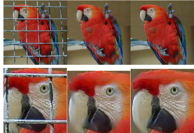
Fig. 3. Original (left), ECM inpainting (middle) and PDE inpainting (right).

The algorithm was finally applied to a real photograph of a parrot, where we wanted to remove the grid of the cage to virtually free the bird. The mask of the grid was manually plotted. The result is shown in Fig.3. Here, the dictionary contained the undecimated DWT and LDCT, penalty: l_1 . For comparative purposes, inpainting results of a PDE-based method [8] are reported. The main differences between the two approaches are essentially concentrated the "textured" area in the vicinity of the parrot's eye.