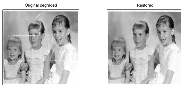
Fig. 3. GEM inpainting of a real degraded image.