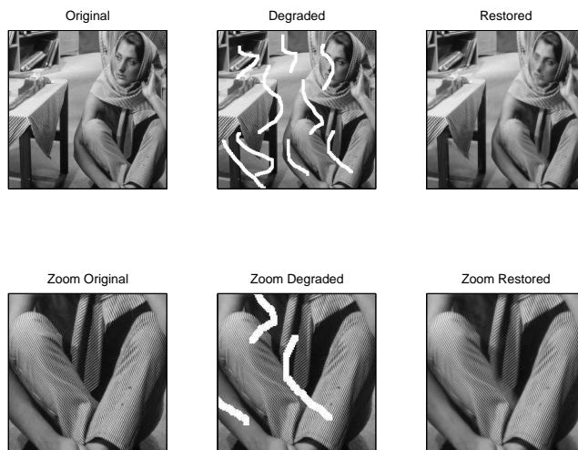
Fig. 2. Example with Barbara.

We proposed a novel generalized EM-based algorithm for image inpainting. Our work is now directed towards deeper investigation of the mathematical properties (e.g. convergence behaviour and relation to stochastic versions of the EM, asymptotic properties, etc) of this algorithm.