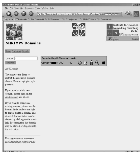
Figure 2: The web based user interface of the SHRIMPS management server. The screenshot shows the domain control UI, where new jobs can be created, started, stopped and the configuration of jobs can be changed.

seconds per page with this system. The system creates Harvest configuration files for breadth-first proximity harvesting of the resources on request.